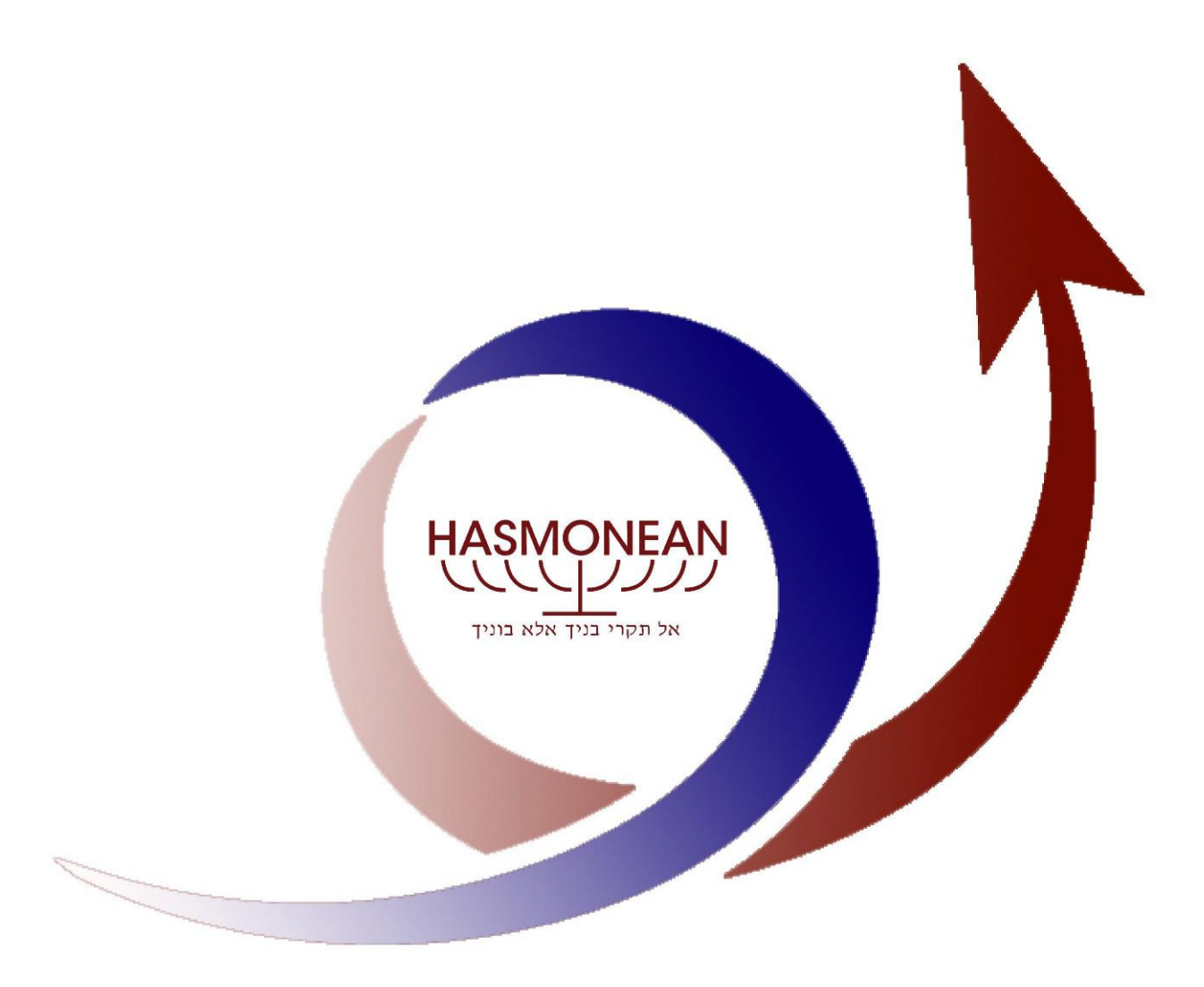
The Yashar Programme